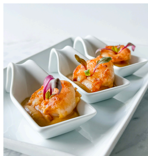
Garlic Shrimp With Butternut Puree