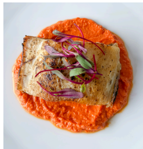
Seared Seabass With Romesco Sauce

Seared Chicken Breast with Cranberry-Currant Pan Sauce | gf, df, sf chicken breast, cranberry, currant, red wine, shallot, garlic