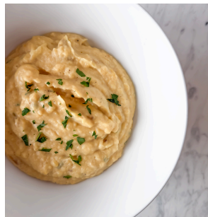
Brown Butter Rutabaga Mashers with Manchego Cheese

Cheesy French Onion Mashed Potatoes | veg, gf, sf yukon potato, caramelized onions, gruyere cheese