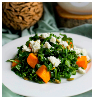
Butternut Squash & Kale Salad

kale, butternut squash, goat cheese, pepitas, apricot vinaigrette