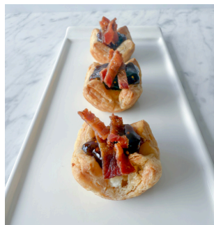
Bacon Fig Puff Pastry

ciabatta baguette, cherry tomato, basil, sea salt, truffle oil