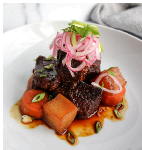
Korean Braised Short Ribs