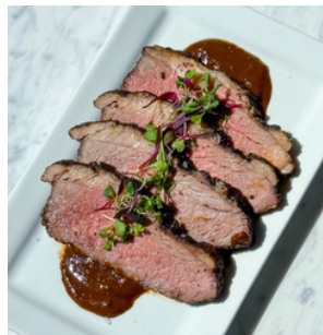
Espresso Infused Mole Tri-tip

Steelhead with Mango Pineapple Citrus Salsa | gf, df, sf pineapple, onion, serrano, bell pepper, mango, cilantro, lime