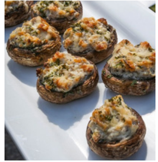
Sausage Stuffed Mushrooms

Fruit, Artisanal Cheese & Charcuterie Board | sf, n | +5 sliced fruit, fine cheese, cured meat, stone fruit, nuts, jam, cracker assortment