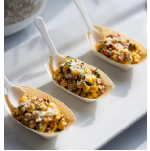
Corn Elote Boats

Peach Caprese Skewer | gf, sf peach, mozzarella, prosciutto, basil, balsamic reduction, olive oil, sea salt