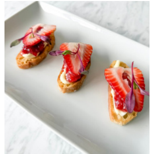
Strawberry & Brie Bites