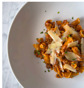
Chorizo Romesco Pasta

BLT Pasta Salad | sf, e penne pasta, bacon, lettuce, tomato, buttermilk, mayo, onion, cheddar cheese, parsley