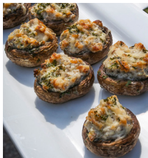
Sausage Stuffed Mushrooms

Fruit, Artisanal Cheese & Charcuterie Board | sf, n | +5 sliced fruit, fine cheese, cured meat, stone fruit, nuts, jam, cracker assortment