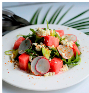
Arugula & Watermelon Salad

Arugula & Watermelon Salad | veg, gf, sf arugula, watermelon, cucumber, radish, feta cheese, tajin, balsamic vinaigrette