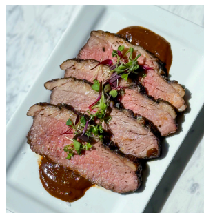
Espresso Infused Mole Tri-tip

Steelhead with Mango Pineapple Citrus Salsa | gf, df, sf pineapple, onion, serrano, bell pepper, mango, cilantro, lime