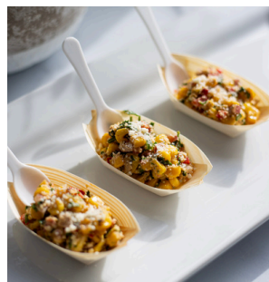
Corn Elote Boats

Peach Caprese Skewer | gf, sf peach, mozzarella, prosciutto, basil, balsamic reduction, olive oil, sea salt