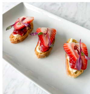
Strawberry & Brie Bites