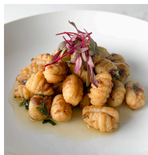
Brown Butter Sage Gnocchi